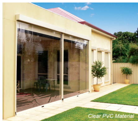
Clear PVC Material