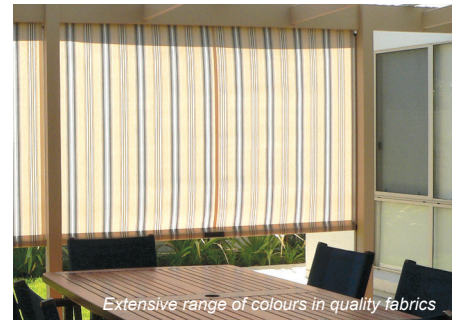
Extensive range of colours in quality fabrics

Discover a simpler way to shade and protect your outdoor way of life.