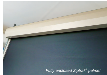
Fully enclosed Ziptrak® pelmet